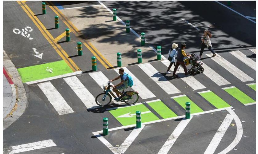
San Jose, CA